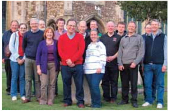
Towcester Branch Outing September