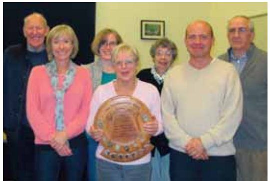
Ashton/Roade, The Jack Green Trophy Winners

wooden spoon will be next year's quizmasters, so we look forward to Potterspury's questions!